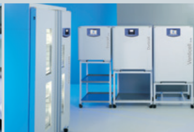
Laboratory drying devices and incubators 22-1212 l