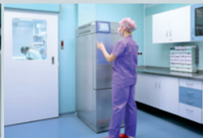
Steam sterilizer 70 l