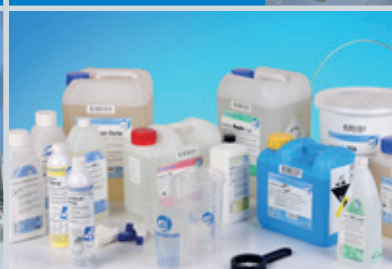
Cleaning and disinfection agents