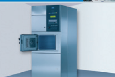
Formaldehyde sterilizer 110 l