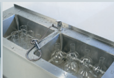
Stainless steel instrumentation