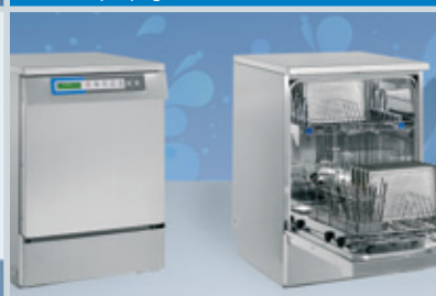
Washer Disinfectors for Medical Usage