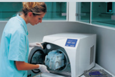
Small steam sterilizers 15-25 l